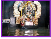
Jala Narasimha Swamy Temple