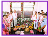
Sangameshwara-Basaveshwara Lift Irrigation Projects